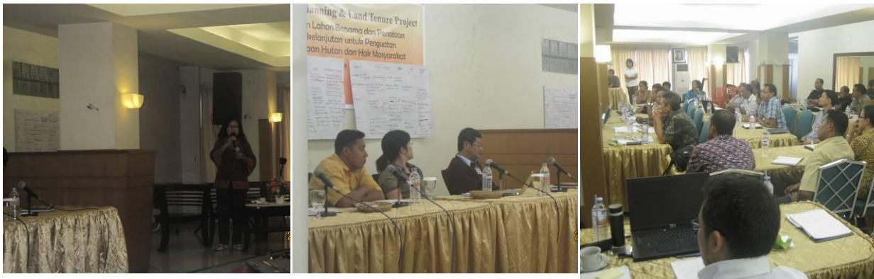
Figure 7. Presentation results from the group discussion and participants during the workshop

Nevertheless, many participants showed their interest in this project and were willing to support and to collaborate in the implementation.